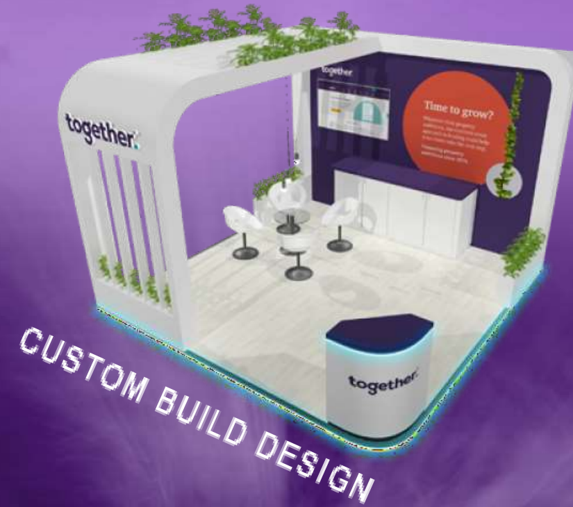
CUSTOM BUILD DESIGN